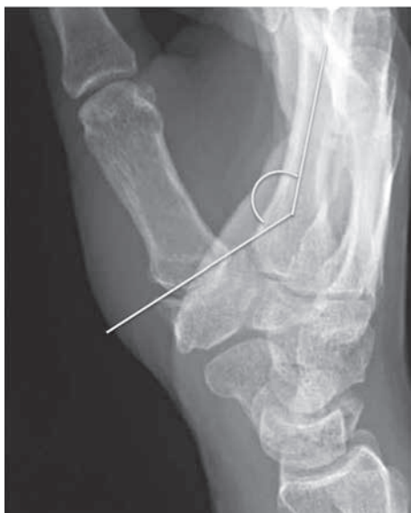
Fig. 2. — Preoperative frontal view of the TM joint with an increased “dévers” angle.

nonsteroidal anti-inflammatory medication and paracetamol.