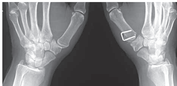
Fig. 4. — Postoperative frontal view of the TM joint of both hands.

Possible complications of metacarpal osteotomies for TM osteoarthritis are peroperative trapezium and metacarpal fractures, dysaesthesia, de Quervain's tendinopathy and complex regional pain syndrome (8). In our series we did not have any complications. In the long term we have to be attentive for progression of arthritis and persistent instability (2,22). In our series, no episodes of remaining instability were noticed. To minimize risk of instability, special