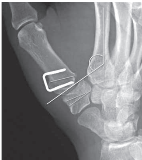
Fig. 3. — Postoperative frontal view of the TM joint with a reduced “dévers” angle.

the TM joint surfaces as the addition-subtraction osteotomy. We believe that the addition-subtraction osteotomy has less morbidity than the more complex vascularized articular osteotomies which have similar biomechanical outcomes or the trapezium opening wedge procedure, which tends to close the first web (15,17,19,21).