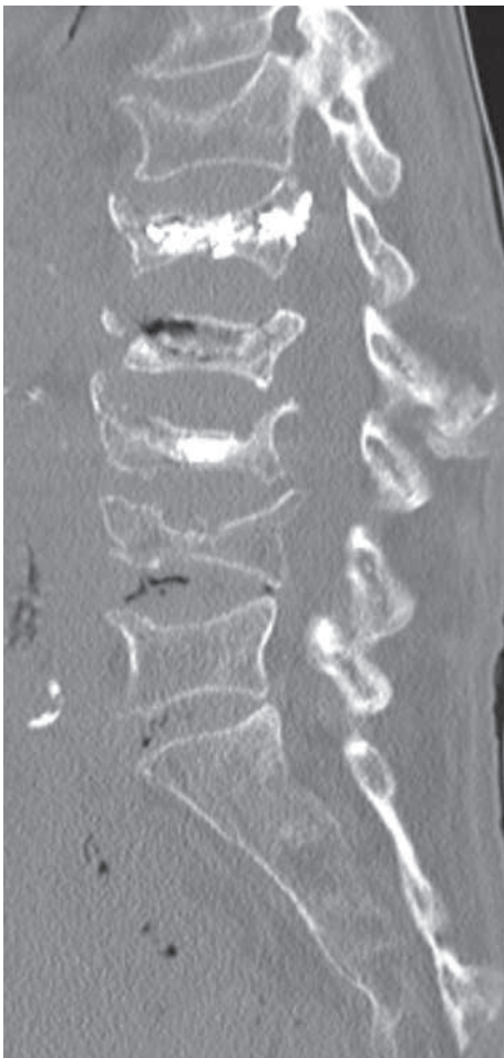
Fig. 3. — Fracture in the posterior third of the vertebral body