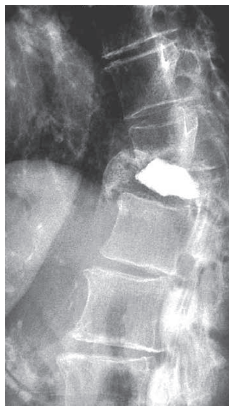
Fig. 1. — Collapse above the cement with spinal canal stenosis and neurological disorder.

Complications are observed in the form of re-fractures of the affected vertebral bodies already treated with kyphoplasty (1,3). In the process, the base and upper plates collapse above the cement formation (Fig. 1). In many cases, the associated loss of height induces an additional fracture of the posterior cortex of the vertebral body. This can result in a displacement of bone and / or PMMA into the spinal canal. The re-fracture may occur after an adequate trauma, but in many cases also without any apparent reason. In such cases, it must be assumed that either a true vertebral body stabilization did not occur after cement application and / or that the remaining bone surrounding the PMMA tamp was progressively resorbed. Either osseous consolidation simply did not occur, or the fracture could already have been assessed to be unstable before the primary intervention. This type of unstable osteoporotic vertebral body fracture is present whenever