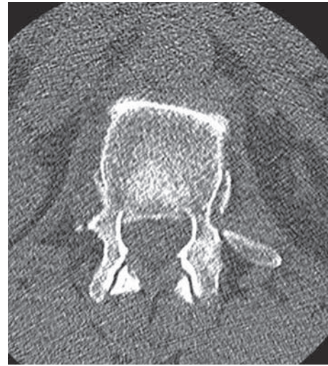
Fig. 4. — Fracture of the posterior edge of the vertebral body in the axial plane with an unstable and displaced posterior wall fragment. An obviously unstable situation.

body collapse, and the A2.2 and A2.3 fractures, i.e. coronal split fracture and pincer fracture, can be fluid.