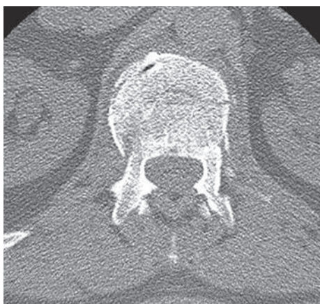
Fig. 5. — Fracture line close to the pedicle region with a stable posterior wall, also to be considered as an unstable situation if a kyphoplasty is planned.

spinal segment affected, including the adjacent segments, as these were to be included in the possible planning of instrumentation, generally 2 segments above and below the vertebral body fracture.