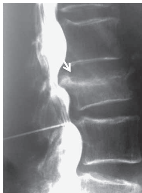
Fig. 6b. — Example of an endplate collapse, comparable to an A 1.3 fracture, but unstable in the analysis if a kyphoplasty is planned.