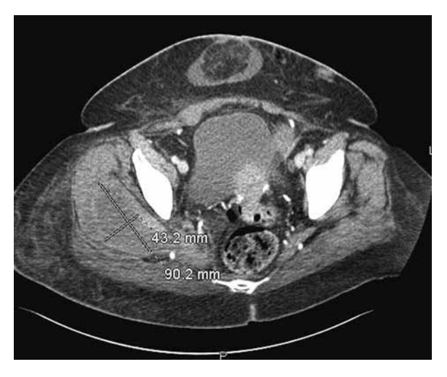
Fig. 1. — Transverse cut through CT Abdomen & Pelvis revealing large haematoma in the right gluteal region.

Orthopaedic opinion was sought as there was now concern for compartment syndrome. Initial examination revealed a soft anterior compartment, with mildly tense medial and posterior compartments. Passive stretch testing was negative. The patient was noted to have a right-sided foot drop. She had power MRC grade 0 out of 5 in right L4-L5 myotomes, and reported decreased sensation MRC grade 0 of 2 in the same distribution. Dorsalis