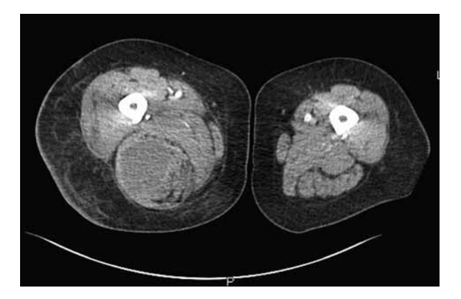
Fig. 3. — Transverse cut of CT demonstrating large haematoma in posterior compartment of right leg.

Numerous causes have been identified in the literature. These include drug abuse (6,14), surgical anaesthesia (4,8), serious illness leading to coma (13) and trauma (9,10). In this case, the patient's pain and sciatic neuropathy were explainable by the clinical findings of a tense posterior compartment, along with CT confirmation of extensive haematoma tracking distally from the glutei down the posterior thigh. The origin of the haematoma formation is less clear. Spontaneous bleeding within the gluteal compartment due to the patient's anticoagulation is conceivable, and has been reported previously (12). Equally, the precipitant could have been iatrogenic injury to a gluteal vessel at the time of bone marrow biopsy. To our knowledge, such a scenario has only