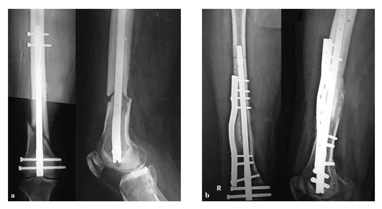
Fig. 1. — (a) Non-union of the distal metaphyseo-diaphyseal right femur 7 months after retrograde nailing in a 35-year-old male. Augmentative wave plate-strut graft fixation with the nail in situ . The proximal locking screws were removed to achieve compression. Union was achieved after 8 months. (b) End follow-up after 18 months : radiological union with fully integrated strut graft.

2 weeks, 6 weeks, and then monthly until union was achieved. Union was defined clinically by absence of pain at the non-union site and radiologically by the appearance of satisfactory bridging callus.