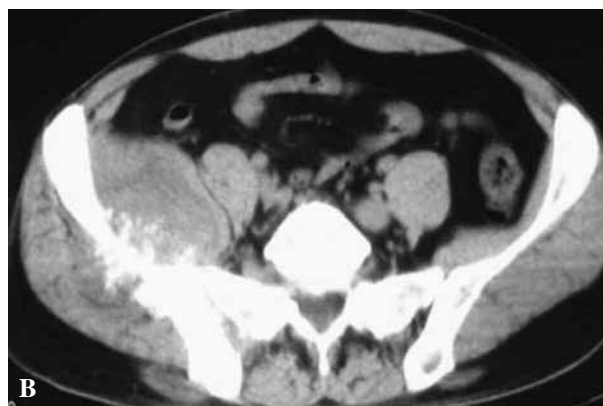
Fig. 1A and 1B. — Preoperative radiologic work-up for case 1. Images suggest a mass involving the right iliac bone and sacroiliac joint.

sacroiliac joint and the left iliac bone (Fig. 2A & 2B). A biopsy was first done at the thoracic spine and resulted in a diagnosis of chondrosarcoma. She underwent en bloc resection of the tumour and combined anterior-posterior stabilization. She was neurologically intact and her back pain was relieved when she was discharged. Three months after the index procedure, a second biopsy was done in the left iliac mass and again showed chondrosarcoma. She underwent en bloc resection of the tumour mass with reconstruction.