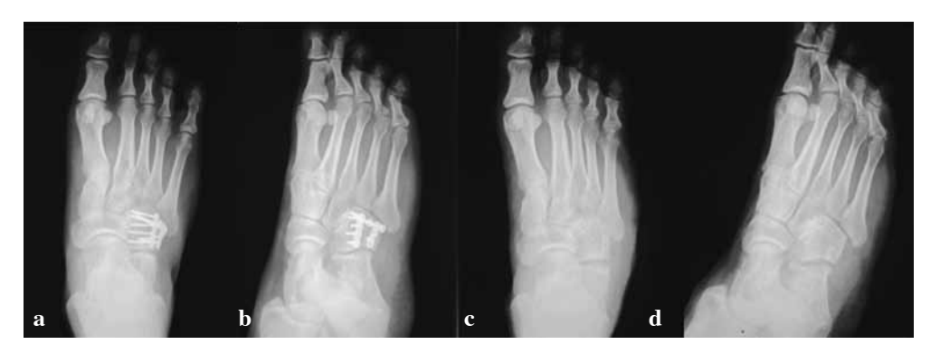
Fig. 2. - Radiograph showing the restoration of the lateral column and joints

(Table I). All 6 patients were evaluated using the AOFAS standardized clinical scoring system for the midfoot (9). Following Kitaoka et al (9) the results were rated as excellent with 90-100 points, good with 80-89, fair with 70-79, or poor with < 70 points.