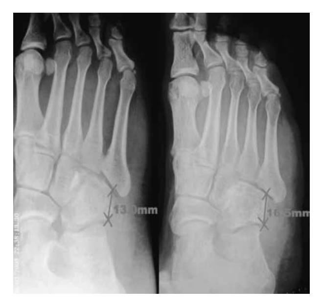
Fig. 3. – Preoperative and postoperative oblique radiograph