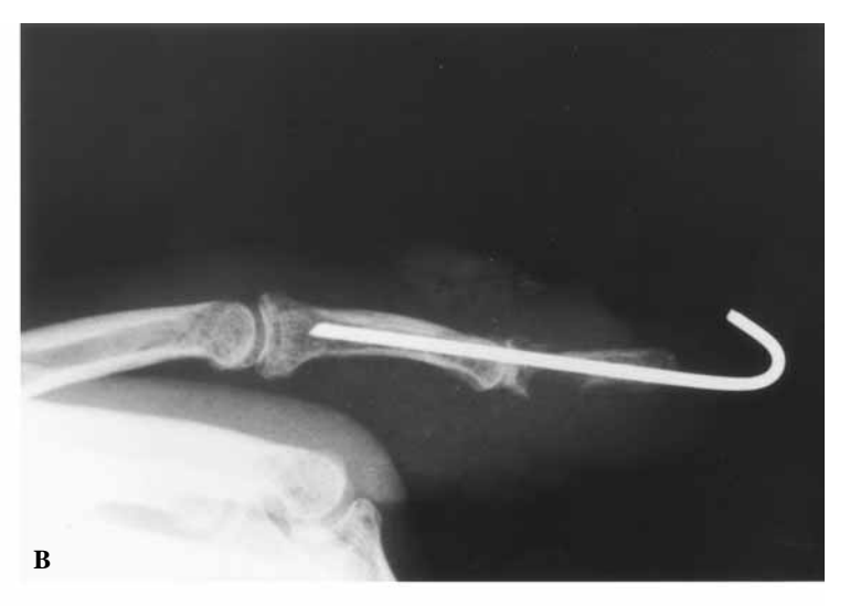
Fig. 1. — Anteroposterior (A) and lateral (B) radiographs show osteomyelitis of both distal and middle phalanges of the left ring digit.

The flexor tendon was undamaged but the bony insertions of the A4 and A5 annular pulleys and C3 pliable cruciate pulley of the digital flexor tendon sheath were sectioned in the bone debridement. An antibiotic-impregnated PMMA spacer (Cemex Genta® Verona, Italy) was used to fill the dead space (fig 2). The surgical wound was partially sutured, avoiding tension. Four weeks after initial surgery, the wound had healed and the patient was symptom free. A second stage was then performed: through a volar approach with an oblique incision of the middle phalangeal zone, the antibioticimpregnated spacer was removed and an autogenous corticocancellous bone graft from the iliac crest was secured into the defect with an intramedullary Herbert scaphoid screw. The skin was closed with simple sutures. The finger was immobilised for three weeks, following which active motion was begun. Six months later, radiographs demonstrated that the bone graft had united with the adjacent phalanges at both ends (fig 3). At the most recent follow-up examination 12 months later, the patient had returned to his