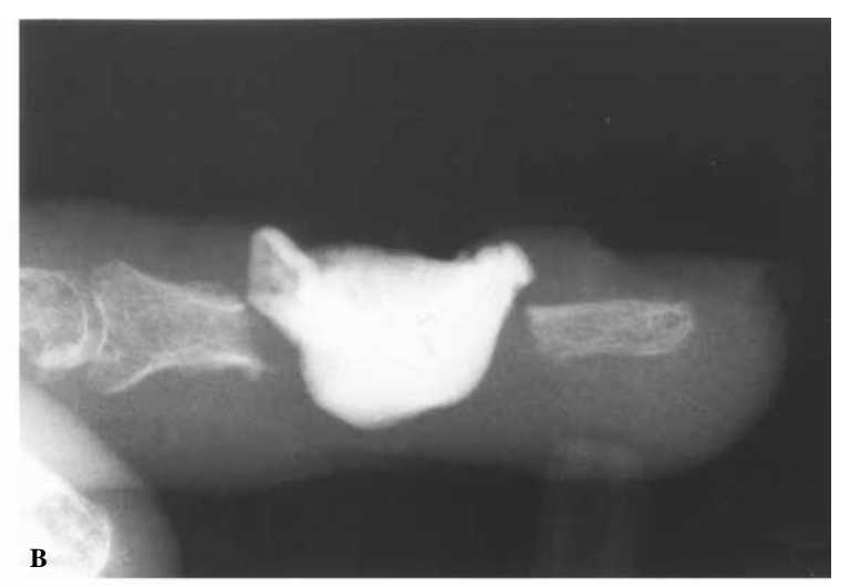
Fig. 2. — Spacer block in situ after resection of all infected bone. A) Anteroposterior view. B) Lateral view.