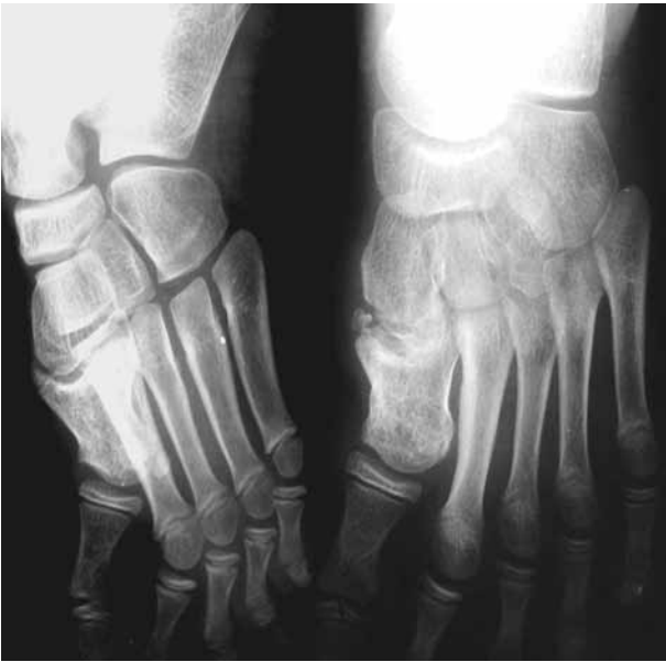
Fig. 3. — Radiograph of the right foot after 7 years follow-up showing filling of the tumour cavity with no evidence of local recurrence but with premature closure of the growth plate responsible for shortening of the first metatarsal.

Giant cell tumours in the foot are known to occur in a younger age group, more often in females and they tend to have a more aggressive behaviour both clinically and radiologically than in other locations (3,9,12,21).