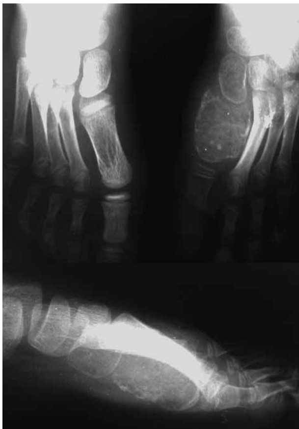
Fig. 1. — A destructive lesion involving the entire right first metatarsal bone with a very thin cortex fractured at places and no periosteal reaction or new bone formation.

a blown-up appearance with several microfractures. Adjacent soft tissue swelling was also noted. There was no periosteal reaction or new bone formation (Fig. 1). Chest radiographs and laboratory tests, including serum calcium and phosphorus levels, were normal.