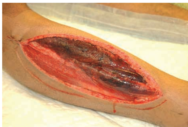
Fig. 1. — Intraoperative photograph of the right leg showing necrotic muscles in the anterior compartment.

The lateral compartment muscles were red, contractile and viable. The wound was packed with V.A.C. GranuFoam dressing (San Antonio, USA), while the skin and aponeurosis were left open, and a posterior splint was applied. The patient was given prophylactic antibiotics. Postoperatively, he noted relief of pain. He was hospitalized and carefully monitored. Two days later, he was brought back to the operating theatre for reevaluation. The peroneal muscles were found to be healthy in appearance, pink and contractile. In contrast, the