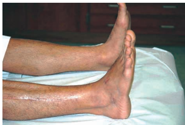
Fig. 3. — Clinical photograph 6 months post surgery demonstrating near full active dorsiflexion of the right ankle.

Next, a horizontal incision was made laterally, distal to the lateral malleolus. The peroneus longus was identified and released distal to the peroneal tubercle on the lateral calcaneal wall. The tendon of peroneus longus was cut at the base of the fifth metatarsal and its distal stump was sutured to the intact peroneus brevis tendon. A second retrofibular incision was made through the existing lateral scar and the peroneus longus was retrieved in the proximal wound. The peroneus longus muscle was carefully mobilized. A third incision was made over the lateral cuneiform under fluoroscopic control. Using a tendon passer introduced through the distal incision under the extensor retinaculum the peroneus longus tendon was delivered. With the ankle maintained in dorsiflexion, the proper tension was estimated. Two # 2 fiberwire sutures were placed through the tendon at this level and through an Endobutton, and the excess tendon was excised. A 4.5 mm drill hole in the center of the lateral cuneiform was made from dorsal to plantar, and the upper cortex was then overdrilled to 7 mm. A Beath