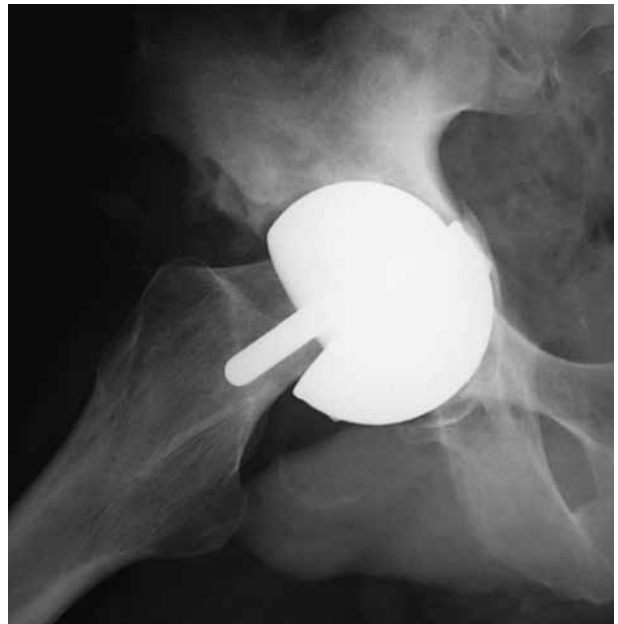
Fig. 3. — Radiograph at failure with marked cup displacement

System. The acetabular cup measured 56 × 50 mm and the outer diameter of the cemented femoral head was 50 mm (ReCap resurfacing femoral head, Biomet). This procedure was performed by the junior author (JDS) as part of a prospective study. The preoperative Harris Hip score was 46. The patient did extremely well. The postoperative Harris Hip score was 95 at 6 months, 99 at 1 year and at 2 years postoperatively. The pre-operative and immediate postoperative radiographs are shown in