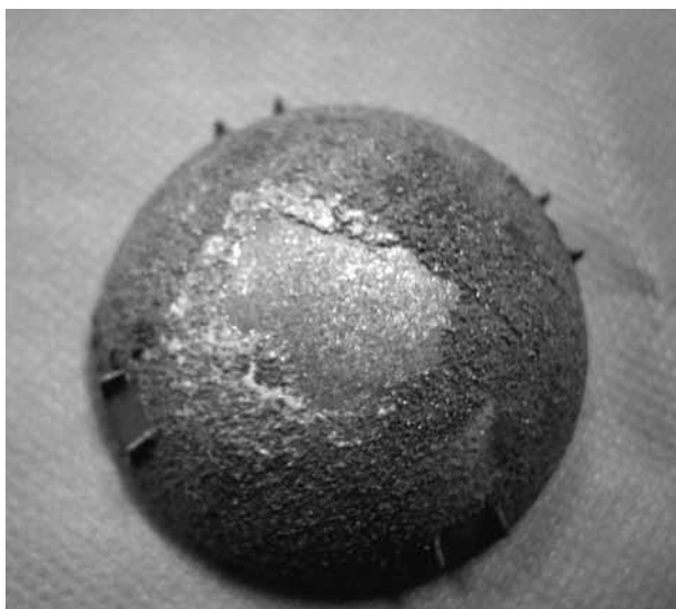
Fig. 4. — View of the porous coated cup showing debonding of the plasma spray coating.

acetabular shell, porous and HA coated, 60 mm diameter, Biomet), was inserted. The femoral component was well fixed in good position, but had to be removed also because a revision cup with a larger outer diameter and an unchanged inner diameter equipped with offset screws for fixation is not available now. A short porous coated and lateralized stem (Taperloc Microplasty 13.5 mm × 112.5 mm, Biomet) replaced the femoral component. The acetabular insert (Exceed ABT ceramic BioloX Delta) and the head (BioloX Delta 36 mm – 3 mm neck type 1 taper, Biomet) were ceramic.