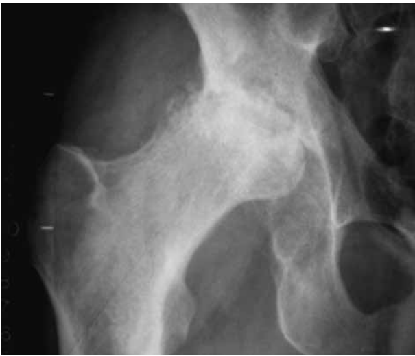
Fig. 1. — Pre-operative radiograph with end-stage arthritis