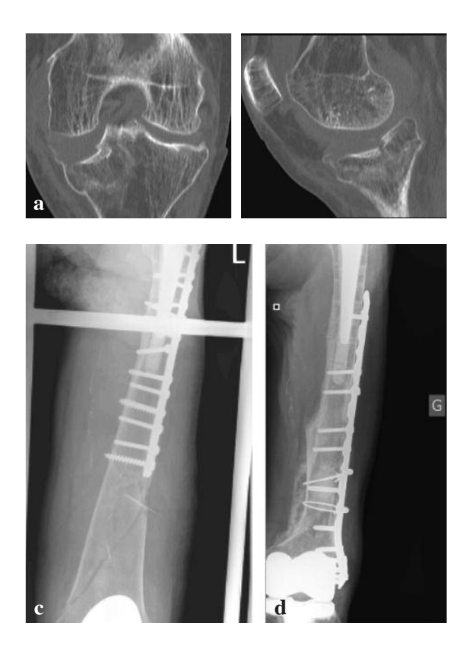
Fig. 3. — Pre-operative computer tomography scan (a) of a 71year-old lady with a comminuted lateral tibal plateau fracture type B3. Postoperative radiographs (b) after TKA. Periprosthetic fracture (c) four years after TKA treated with a locking plate and cables (d).

A 58-year-old man showed signs of arthrofibrosis eight months after surgery and seemed non-compliant with physiotherapy. However, at final follow-up he unexpectedly made an spontaneous recovery.