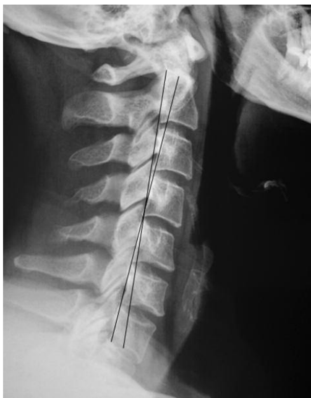
Fig. 1. — Posterior tangent method of Harrison et al (16) : the angle formed by the tangent lines at the posterior margins of the vertebral bodies C2 and C7 is a measure of the cervical sagittal curve.

+4° (positive = kyphotic), while the grey area in between or “loss of cervical lordosis” was defined as +4° to -4° (19). The upper (T1-T6), the lower (T6-T12), and the whole (T1-T12) thoracic kyphosis were measured by means of the Cobb method. Global sagittal alignment was analyzed by measuring the horizontal distance between the plumb line (a vertical line drawn through the center of C7 vertebra) and the posterior (modified technique : classically the anterior ) superior corner of the sacrum. All the measurements were done by the same observer (SE).