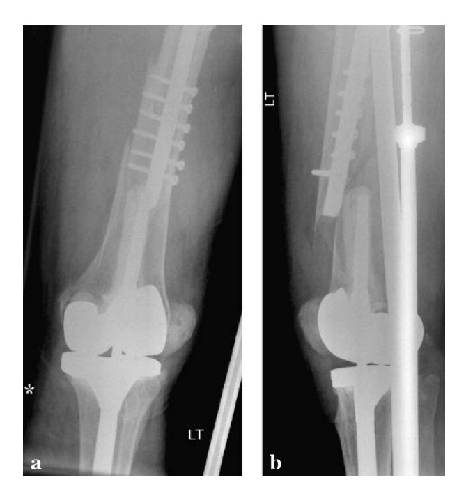
Fig. 1. — Illustrative AP (a) and lateral (b) radiographic example of a transverse fracture at junction of a stable stemmed femoral knee component and revision locked long femoral hip component.

These fractures represent a surgical challenge in an often physiologically suboptimal patient. The management issues raised by an interprosthetic fracture between ipsilateral hip and knee replacements are yet more extensive. There is, however, little guidance on the surgical management of such a fracture, often comminuted, with poor bone stock, in this frail patient cohort.