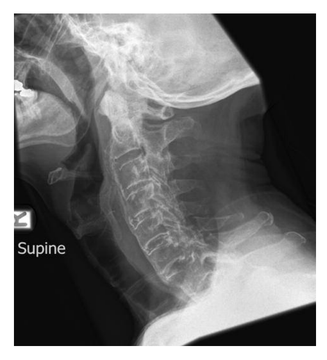
Fig. 1. —Plain radiograph (lateral view) of the cervical spine : fracture through the vertebral body C7. Ankylosing spondylitis.