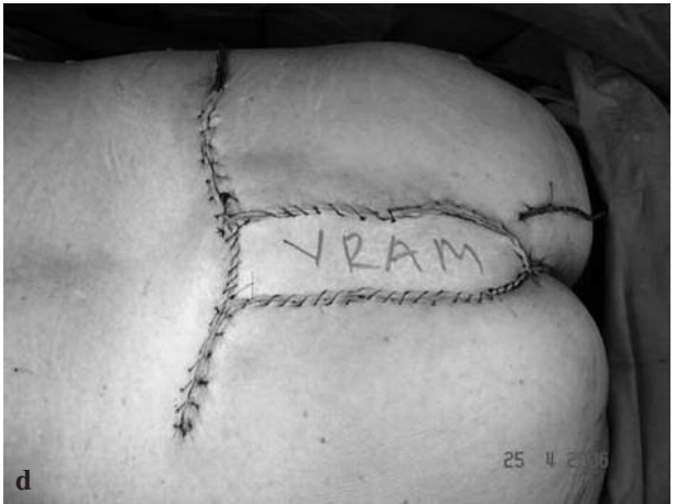
Fig. 2. — The preparation of a vertical rectus abdominis myocutaneous flap (VRAM) is shown. a : planning of the skin incision; b : rectus abdominis is elevated; c : flap is passed to the posterior incision; d : postoperative image.

10 cm in six patients and 10 cm or above in 11 patients.