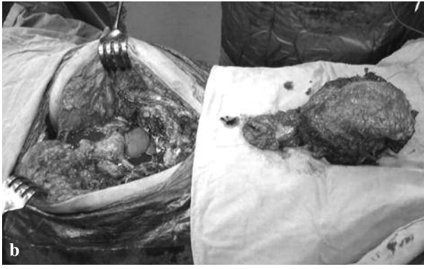
(fig 2, a-d). To cover dead space, other techniques included a gluteus maximus advancement flap in two patients, a prolene mesh in five patients and a silicone breast prosthesis in two patients. Adjuvant radiotherapy was used in the first three patients in the series, who were treated with the posterior approach and had inadequate surgical margins. Two patients underwent total sacrectomy. One of those underwent total sacrectomy with the combined anterior and posterior approach followed by reconstruc-