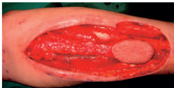
Fig. 1c. — Peroperative view of the flap and pedicle