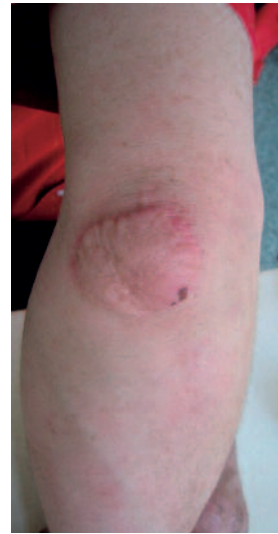
Fig. 1e. — Appearance of the flap one year postoperatively

random flaps, pedicled axial fasciocutaneous flaps (e.g., radial forearm flap, lateral arm flap, antecubital fasciocutaneous flap, posterior interosseous flap), pedicled muscle flaps and free flaps (4,7,8). For small defects good results have been reported with the anconeus flap, the radial forearm flap (3,7,8) and with a local transposition flap and skin graft (4).