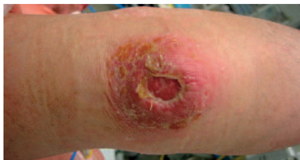
Fig. 1a. — Preoperative skin defect at the olecranon of a 41-year old man who was treated with an antecubital fasciocutaneous island flap.

In three patients primary closure of the skin and immobilisation of the elbow in extension was the first choice of treatment. The wound was debrided and the skin closed with separate stitches. Postoperatively, a splint with the elbow in extension was applied. A few days later the splint was replaced by a circular cast with a window at the olecranon to enable wound care. The wrist was not immobilised. Elbow flexion was allowed when the wound had healed.