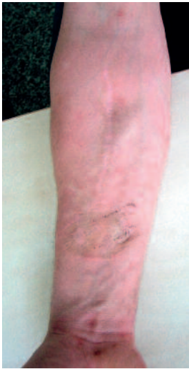
Fig. 1d. — Appearance of the donor site one year postoperatively.