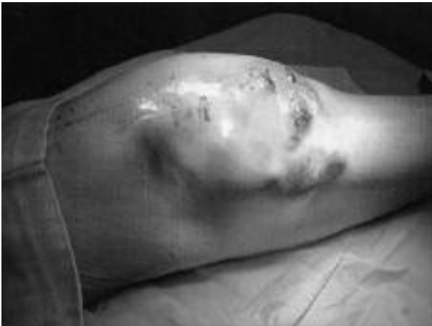
Fig. 3. — Photograph of the knee showing ulcerative nodular skin lesions, six weeks after the revision arthroplasty.

metastasis, with an associated pleural effusion, and a smaller lesion, about 1 cm in diameter, at the base of the right hemithorax. Liver echotomography, abdominal CT-scan, brain CT-scan and TC99m bone scan were negative.