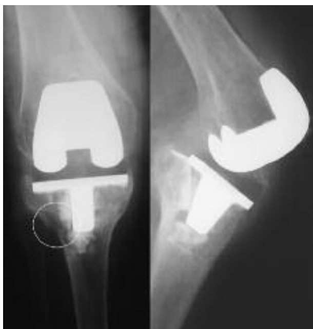
Fig. 1. — Preoperative radiographs showing tibial implant loosening. On careful inspection of the lateral tibial plateau we observe thinning of the cortical bone and cancellous bone rarefaction, suspect of malignancy.

showed anterior tilt and subsidence of the tibial implant (fig 1). The diagnosis of tibial loosening secondary to a traumatic fracture was accepted, and revision of the tibial component was performed four days later. After removal of the implant and bone cement, we observed a complete loss of the cortical bone around the implant, except for the most posterior proximal tibial cortex. Biopsies of the surrounding tissue were sent for histological analysis. A cemented revision tibial component was then implanted, after bone allografting of the defects.