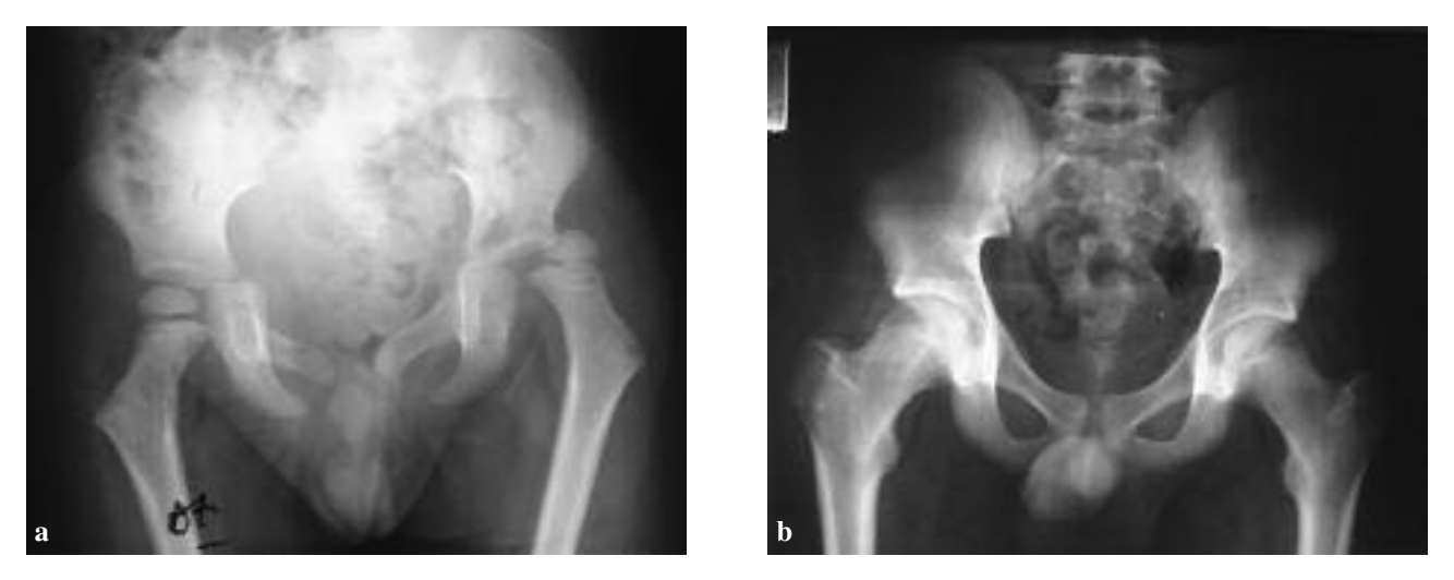
\emph{Fig. 3.} — a. AP radiograph of the pelvis in a 5-year-old boy: posterior dislocation of the left hip; b. AP radiograph of the pelvis 12 years after reduction: the hip appears normal.