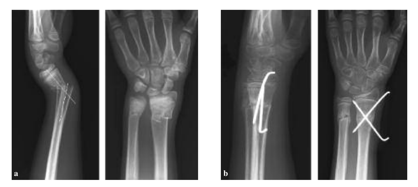
Fig. 1. — Dorsal angulation of 53^{\circ} of the distal radius in a 13-year-old boy. Presence of an ipsilateral ulna fracture (a). Treatment by closed reduction and pinning. The cast was removed after six weeks and radiographs showed solid callus formation. The pins were subsequently removed (b).

The second group consisted of 15 patients who were treated by closed reduction and immediate percutaneous pinning (fig 1b). The decision to perform pinning after reduction depended on the surgeon's choice and his appreciation of instability. After pinning, patients were placed in a forearm cast for 4 to 6 weeks, depending on their age. Radiographs were taken one week and 4 to 6 weeks after reduction and pinning. The pins were removed at the time of cast removal.