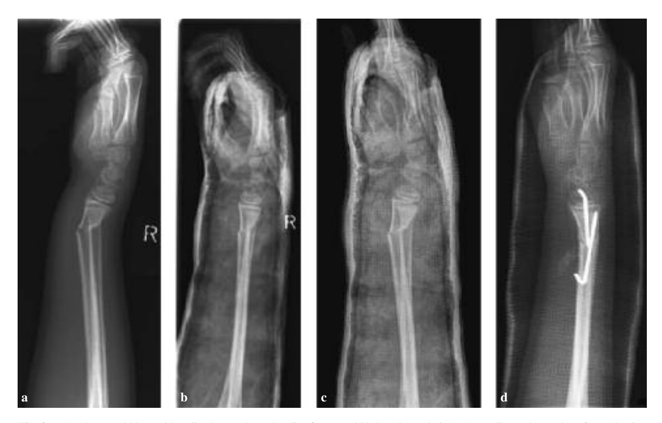
Fig. 2. —A 12-year-old boy with a distal metaphyseal radius fracture ( 32^{\circ} dorsal angulation) (a). Radiograph one day after reduction shows good alignment (b). Radiograph one week after reduction shows marked angulation (c). A closed reduction and pinning was performed (d).