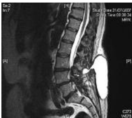
Fig. 1a. — Sagittal MRI of pseudomeningocele