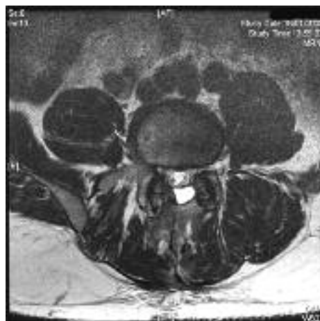
Fig. 2b. — Axial MRI of resolved pseudomeningocele

Six weeks after surgery the patient complained about a large boggy swelling at the wound site together with headaches, made worse by sitting for long periods or walking. He did not have any focal neurological symptoms. A diagnosis of pseudomeningocele was made. An MRI scan (fig 1a & 1b), 5 months post operation, revealed a pseudomeningocele, lying in the subcutaneous tissues. It measured 11 cm × 3 cm × 6 cm. It was seen to be tracking down to the L4/L5 level. The patient was referred to the neurosurgical unit for surgical repair. Here a wait and see policy was followed, and during the ensuing six months the symptoms resolved. The patient returned for review to the spinal service. The swelling had disappeared, along with the headaches. A repeat MRI (fig 2a & 2b) demonstrated spontaneous resolution of the massive pseudo-