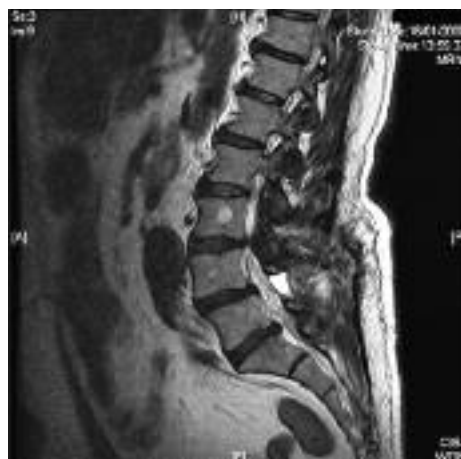
Fig. 2a. — Sagittal MRI of resolved pseudomeningocele