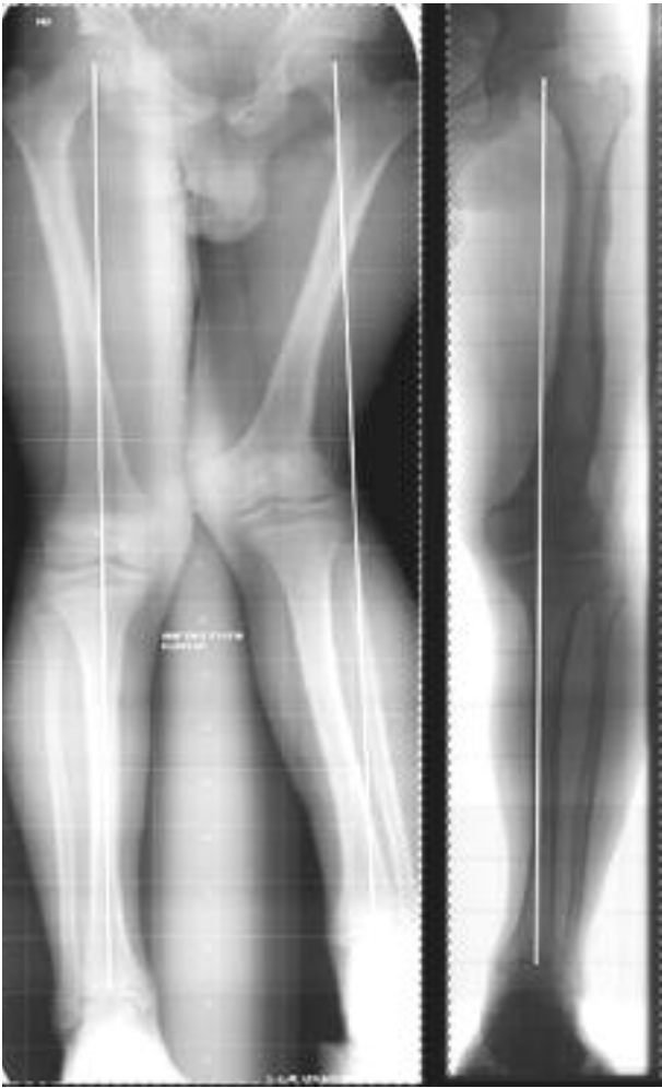
Fig. 4. — Patient with lateral partial physeal arrest after distal femoral fracture. Left : Preoperatively. Right : After the correction, at skeletal maturity.

might have influenced final leg length to some degree. Furthermore, our report is based on five patients only. However, patients with partial physeal arrest and such advanced stages of deformities when treatment is initiated are rare. Predictions of remaining growth were made based on Green and Anderson's growth chart. Other, more sophisticated, methods for leg length prediction like Moseley's (20) or Paley's method (24) might have given more accurate results.