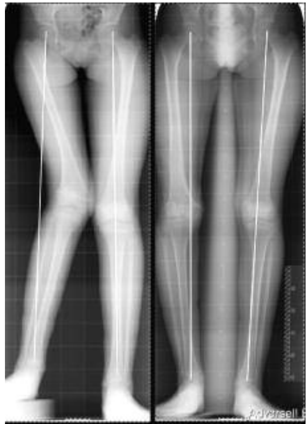
Fig. 5. — Patient with partial physeal arrest at lateral and anterior part of the right distal femoral physis. Left : Preoperative full-leg standing radiograph with severe valgus deformity and shortening. Right : After correction, with slight overcorrection into varus angulation.

However, our study shows that in cases of partial physeal arrest with severe symptomatic deformities,