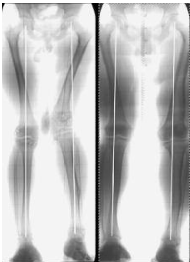
Fig. 1. — Patient with partial physeal arrest in the distal lateral femoral physis after a car accident. Left : Preoperatively. Right : After correction, at skeletal maturity.