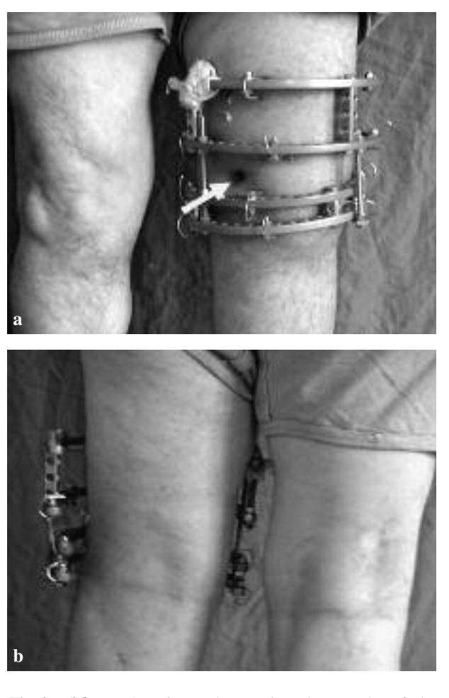
Fig. 2 a&b. — Anterior and posterior photographs of the supracondylar femoral fracture in patient #. 8 with a previous history of chronic osteomyelitis and septic arthritis sequelae. A healed fistula tract can be seen (arrow).

construct in the mediolateral plane. No extension across the knee to the tibia was used. The system was not extended to the proximal femur and no Schanz screws were used. No bone graft or synthetic bone substitute was used in any of the patients. No resection was used in non-union cases; however, compression at the nonunion site was performed manually before final locking of the construct. No fracture table was used. After fixation of the whole system, the knee was flexed to the maximum possible degree of flexion (full flexion in fresh fractures and maximum amount of flexion depending on the preoperative range of motion [ROM] in the nonunion cases) to release the iliotibial band. All patients received parenteral antibiotics for two days. In septic non-unions, appropriate antibiotherapy was continued for six weeks. Patients were allowed to shower two weeks after surgery after removal of the sutures. The patients were advised to perform pin site care by daily showering and cleaning the crusts using sterile gauze impregnated with 10% polyvinylpyrrolidone iodine. Pin sites were left open (without any sterile covering) afterwards.