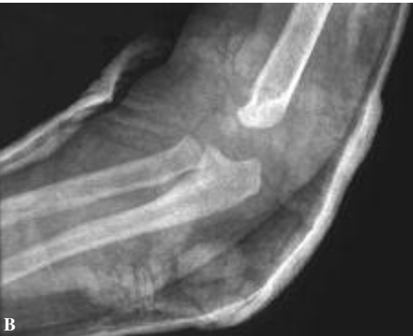
Fig. 2. — AP (A) and lateral (B) radiographs after reduction and application of plaster slab.

The patient was discharged home the following day and was reviewed in the outpatient fracture clinic two weeks later. Radiographic examination showed a maintained reduction with a congruent elbow joint (fig 2). The plaster back-slab was then removed and the patient was allowed active mobilisation. The elbow range of movement at that time was from 10° to 90° of flexion with full pronation and supination movements. At last follow-up, 4 months post injury, the patient regained a full and