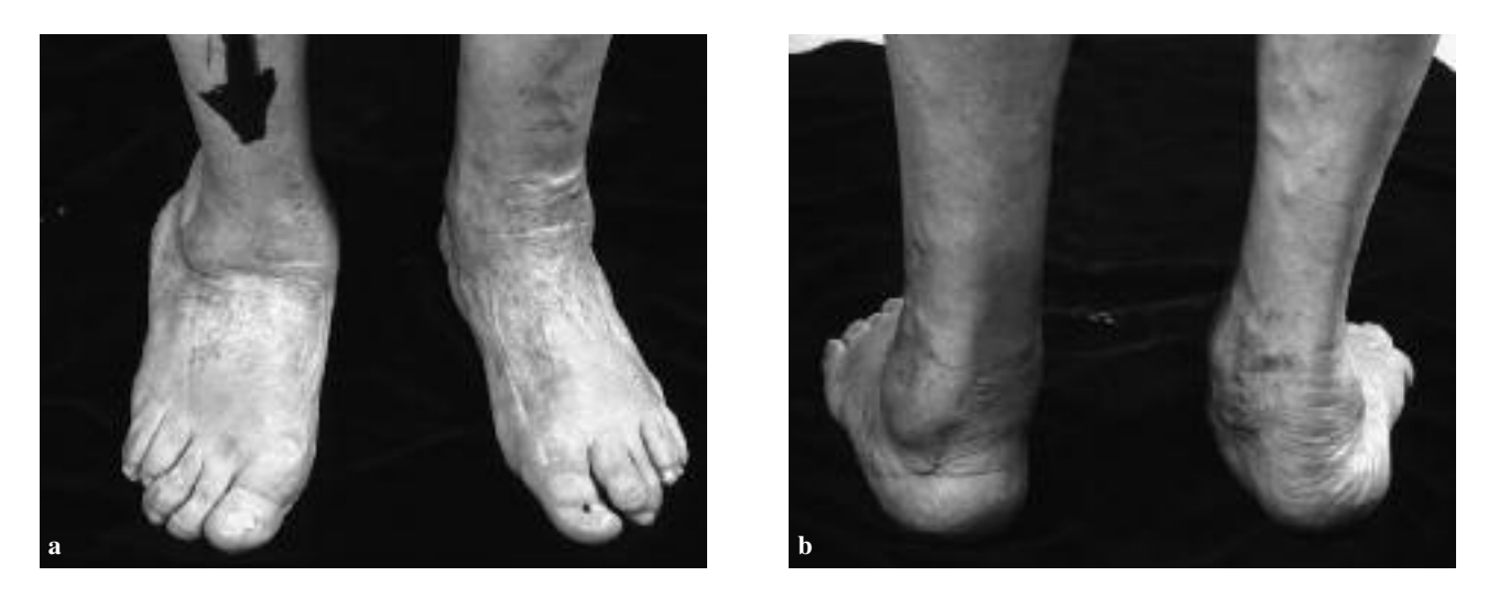
Fig. 3a/b. — Photographs showing valgus deformity and "too many toe signs" of the right foot, and postoperative appearance of the previously corrected left foot (a) Frontal view (b) Rear view.

surgery. The average preoperative and postoperative scores for those with intact tendons were 59 and 82 respectively (average improvement = 23, statistically significant (p < 0.0001)), with a 76% subjective satisfaction rate ("much better" or "better"). The average preoperative and postoperative scores for those with ruptured tendons were 56 and 88 respectively (average improvement = 32, statistically significant (p < 0.0001)), with a 94% subjective satisfaction rate ("much better" or "better"). The difference in postoperative scores between the two subgroups is not statistically significant (p = 0.168).