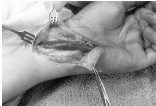
Fig. 2. — A palmaris accessorius muscle crossing Guyon's canal.

A recent report however provides a nice illustration of an abnormal palmaris longus muscle, compressing both median and ulnar nerve on MRI (69)