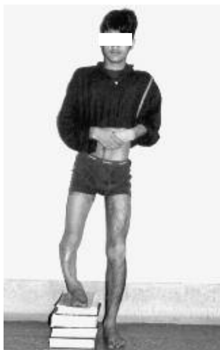
Fig. 1. — Preoperative photograph of the patient showing shortening of his right leg.

osteomyelitis at the age of 9 years. Over the years he had multiple abscess drainages, and was left with a stiff left hip and a severely deformed right leg. Huntington's procedure for centralization of the right fibula had been performed at the age of 11 years. At the time of presentation to our clinic, the patient had an ankylosed left hip and a deformed right leg. On examination a total shortening of 22 cm was calculated with a contribution of 4 cm and 18 cm respectively for the femur and tibia (fig 1). There was a full range of motion at the right hip and knee with no movements at the ankle. The radiograph of the right leg revealed a well-hypertrophied tibialized fibula, however with multi-planar deformities comprising of varus, procurvatum, internal rotation at the proximal end, and the ankle was fused with a varus deformity at the distal end of the centralized fibula (fig 2).