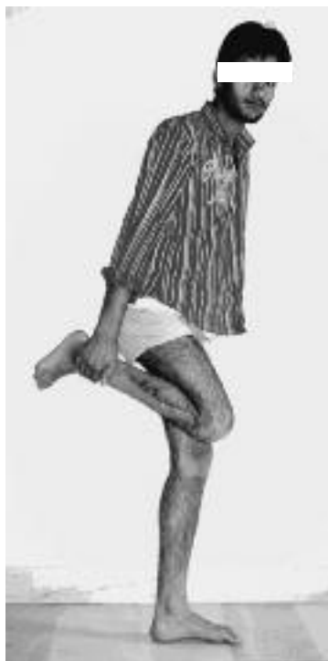
Fig. 7. — Clinical photograph showing range of motion of ipsilateral knee.