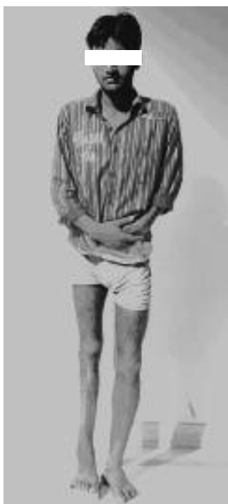
Fig. 6. — Limb length discrepancy corrected within two cm