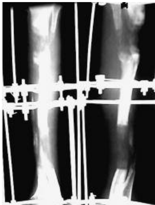
Fig. 4. — Radiograph during lengthening at two sites. Deformity corrected.