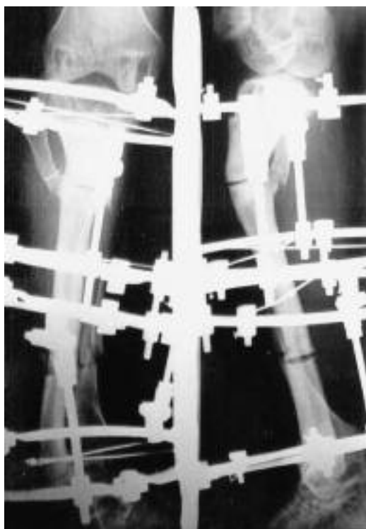
Fig. 3. — Postoperative radiograph : corticotomy performed at two proposed sites.