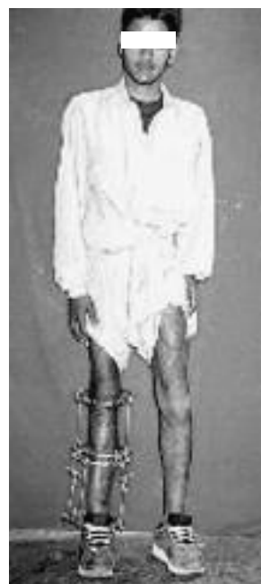
Fig. 5. — Clinical photograph during the period of consolidation.

After length equalization and deformity correction the frame was left in place till consolidation of the regenerate (fig 5). During the whole process of treatment the patient was encouraged to do physiotherapy and weight bearing as tolerated. A total of 20 cm length was achieved in the centralized fibula (fig 6). The patient retained excellent range of motion of the ipsilateral knee (fig 7). It took a total of 17 months for the consolidation of the regenerate and removal of the fixator (fig 8). At the fourth year of follow-up the patient is very happy with the end result of the procedure. Apart from minor pin tract infection, there were no major complications.