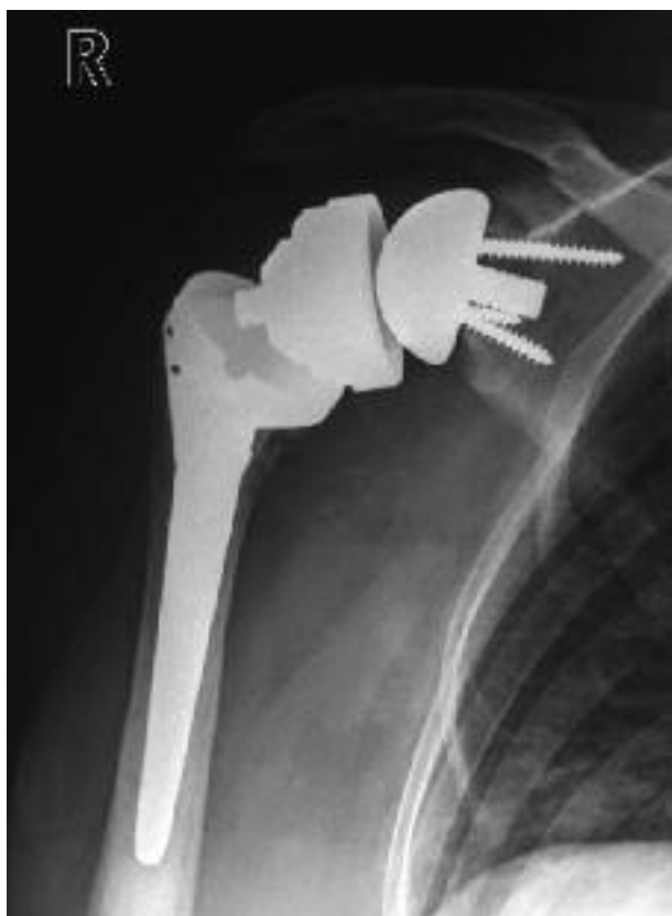
Fig. 1. — Loosening of the humeral 9-mm lengthener. Note inferior osteolysis due to impingement of the retentive cup.

Radiography showed loosening of the 9-mm lengthener from the humeral stem (fig 1). The polyethylene insert was still articulating with the glenoid component. During revision operation a severe grey-coloured synovitis was noted (fig 2). A synovectomy was performed and pathological investigation showed severe metallosis and fibrosis. The loose 9-mm lengthener with the retentive polyethylene insert was removed. When inspecting the insert the articulating polyethylene surface was found to have severe wear, and the screw thread of the lengthener was badly damaged (fig 3a, b). The cemented humeral stem and the non-cemented glenoid components were neither damaged nor loose. We noted significant signs of inferior impingement which radiographically could be classified as a grade II notching according to the radiographic scoring system proposed by Valentini et al (13). The