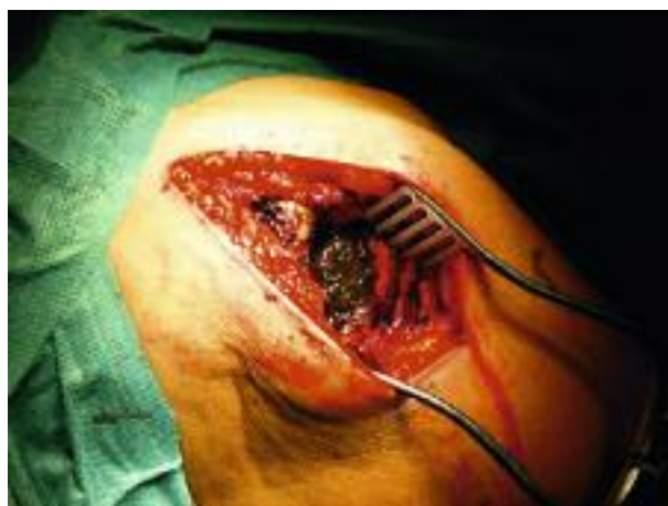
Fig. 2. — Severe metallosis of the joint synovium

Radiography showed loosening of the 9-mm lengthener from the humeral stem (fig 1). The polyethylene insert was still articulating with the glenoid component. During revision operation a severe grey-coloured synovitis was noted (fig 2). A synovectomy was performed and pathological investigation showed severe metallosis and fibrosis. The loose 9-mm lengthener with the retentive polyethylene insert was removed. When inspecting the insert the articulating polyethylene surface was found to have severe wear, and the screw thread of the lengthener was badly damaged (fig 3a, b). The cemented humeral stem and the non-cemented glenoid components were neither damaged nor loose. We noted significant signs of inferior impingement which radiographically could be classified as a grade II notching according to the radiographic scoring system proposed by Valentini et al (13). The