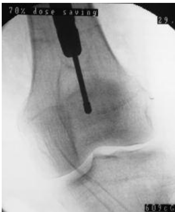
Fig. 1. — Intra-operative fluoroscopic image showing introduction of fish hook wire into the distal part of a broken intramedullary femoral nail.

nail. Both nails were Smith & Nephew's standard femoral locking intramedullary nails.