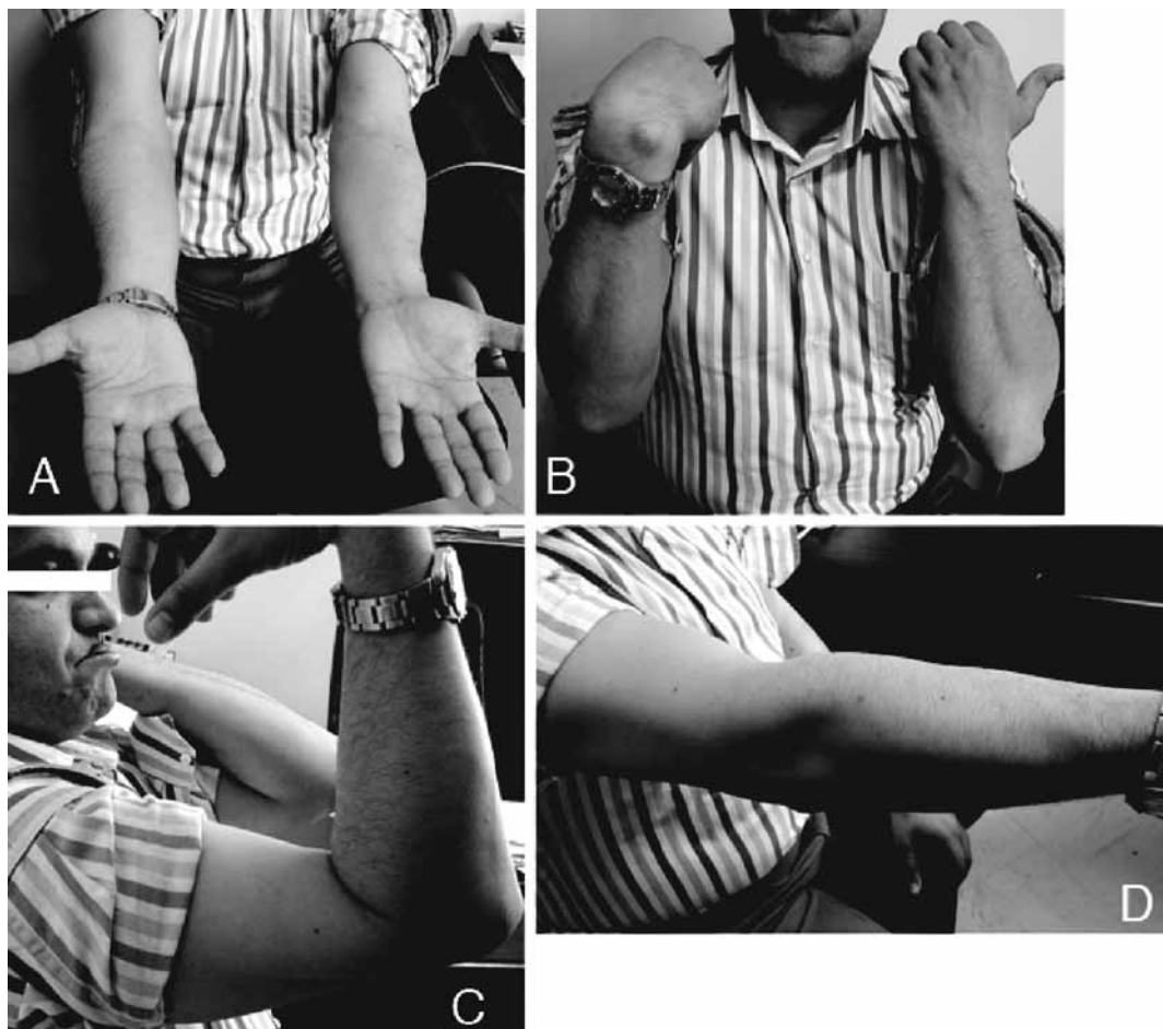
Fig. 1. — Photographs showing the right forearm and the elbow of the patient in extension and flexion

unchanged thereafter. During examination, the right elbow was pain free and stable (in extension and in flexion) and the distal radio-ulnar and radiocarpal joints were also asymptomatic. The strength of the limb was equal to the unaffected contralateral upper limb and the patient was able to work manually as a waiter (using mainly his right limb) for the last 20 years without any problems. The only obvious defect was a 30° lack of flexion and a 10° lack of pronation as compared with the normal side. The carrying angle was equal to the contralateral uninjured side (fig 1). We asked the patient to allow us to check his right elbow and forearm radiographically in order to see the condition of the joints and the bone morphology 39 years post-injury. He had not kept any post-injury radiograph. Antero-posterior