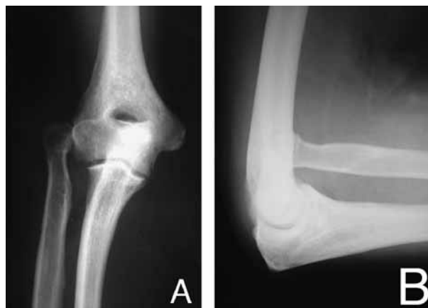
Fig. 3. — Radiographic views focusing on the elbow (A, B).

The question that arises with this case is to know what was the primary lesion. The lateral and slight anterior bowing of the ulna in this patient as they were revealed in the AP and lateral forearm radiographs presumably represent a remodeled displaced old fracture of the upper ulnar metaphysis. Having in mind that the position of the dislocated radial head indicates the angulation of the ulna fracture (11), we may speculate that this angulation was antero-lateral. Combined with the clear information from the patient's history that he was treated for a distal radius fracture, this leads to the conclusion that this case probably represents the sequelae of a mistreated Galeazzi fracture associated with a Monteggia type III injury according to the Bado classification (lateral or anterolateral dislocation of the radial head combined with a fracture of the ulnar metaphysis). If there was not such a clear description of the initial injury, this case should be