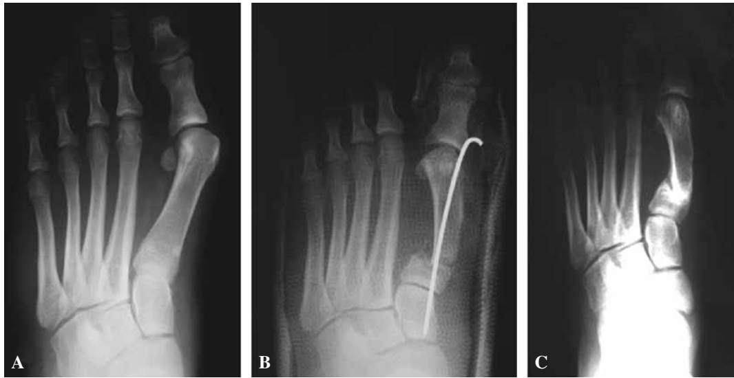
Fig. 1. — A 14.9 year-old girl had pain for 1.5 years at the site of the bunion before undergoing a metatarsal osteotomy. A : Preoperative A/P standing radiograph of the left foot. B : Manipulation of the distal fragment laterally and translation of the proximal fragment medially followed by transfixion of the concave osteotomy. The Steinman pin penetrates the 1st tarsometatarsal joint. C : A/P radiograph of the left foot with the patient standing, 35 months after the operation.