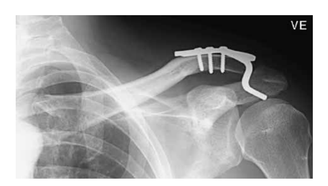
Fig. 2. — Postoperative radiograph of the same patient showing reposition of the acromioclavicular joint and fixation with a hook plate.

operation was performed in a beach chair position; through a transverse skin incision following the lateral third of the clavicle, a muscular split was done and the lateral part of the clavicle, the medial part of the acromion and the acromioclavicular joint (in some cases) were exposed. All or part of the meniscus was removed if it was injured, and osteophytes were removed if present. The dislocated acromioclavicular joint was reduced and fixed using a hook plate with appropriate offset (15-18 mm) (fig 2). The articular capsule including the acromioclavicular ligaments were reconstructed and sutured with zero Dexon suture material. No coracoclavicular ligament reconstruction was attempted.