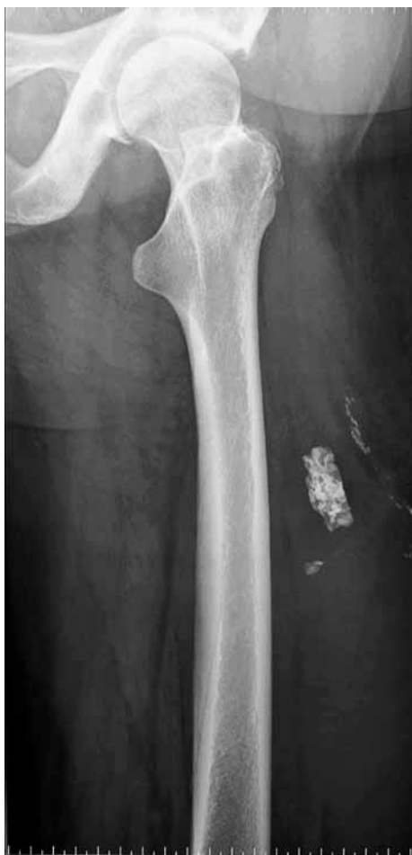
Fig. 1. — The lateral view of the left proximal femur illustrates the metallic object mimicking calcification of a soft tissue tumour.

from these areas. The T1 and STIR high signal intensity suggested that this was a cystic or fluid lesion as apposed to the soft tissue of the thigh.