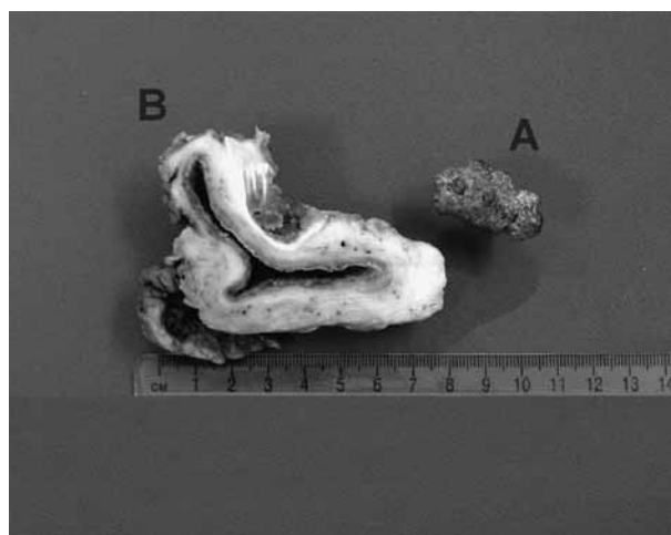
Fig. 3. — A. The ferro-metallic foreign body. B. The macroscopic appearance of the inflammatory cavity.

tion to metallic material. There was no evidence of malignancy.