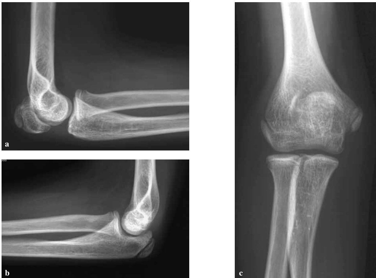
Fig. 2a-c. — Preoperative radiographs show the congenital pseudarthrosis of the olecranon, and the contralateral elbow for comparison.