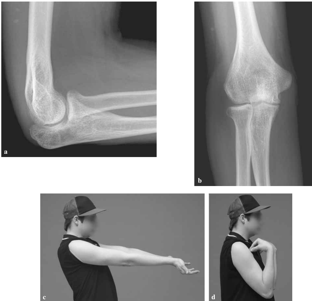
Fig. 4a-d. — Radiographs at latest follow-up with a normal elbow joint ; clinically there was a full range of motion of the right elbow

shaped lengthening of the triceps tendon, followed by 30 days of plaster cast immobilisation in a 15-month-old boy. At 2-year follow-up the patient showed bony fusion with 10° extension deficit on both operated sides. The third reported patient was a 13-year-old boy not hampered by a mild flexion contracture. Because of the asymptomatic presentation no treatment was recommended (4).