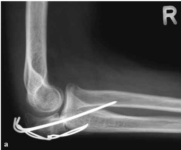
Fig. 3a-b. — Postoperative documentation with the interposed graft in anatomical position.