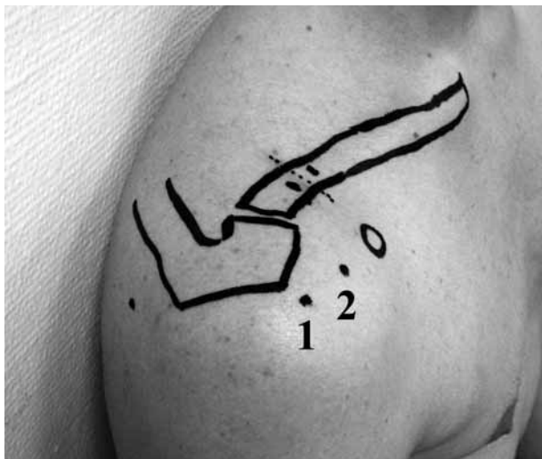
Fig. 1. — Landmarks. Prior to the procedure the total clavicle length is measured. The coracoid, clavicle, acromion, AC-joint, the dorsolateral soft spot, the anterolateral portal one (1) and the anterolateral portal two (2) are marked. On top of the clavicle the skin incision as well as the points for clavicular drilling holes are indicated according to the total clavicle length.

17% (trapezoid insertion, approximately 2.5 cm) and 30% (conoid insertion, approximately 4.5 cm) of the total clavicle length are measured medial to the lateral clavicular edge and are marked for optimal clavicular tunnel placement on top of the clavicle with a sterile pen (fig 1). Initial diagnostic glenohumeral joint arthroscopy is performed with a 30° 4-mm arthroscope through the standard posterior portal. Two anterolateral portals are located through the rotator cuff interval in order to provide working access to the coracoid undersurface (fig 1). The camera is introduced into the subacromial space and a 3.5-mm 90° radiofrequency ablation device (Opes®, Arthrex, FL, USA) is inserted through portal 1. The AC-joint is visualised and the disc is removed if damaged. The arthroscope is reinserted into the glenohumeral joint via the portal 1. By use of the ablation device through portal 2 the coracoid undersurface is prepared circumferentially to visualise the medial and lateral edge as well as the base tip and the precipice of the coracoid. Following coracoid preparation a 3 cm vertical skin incision is set directly over and perpendicular to the clavicle in alignment with the coracoid, between the