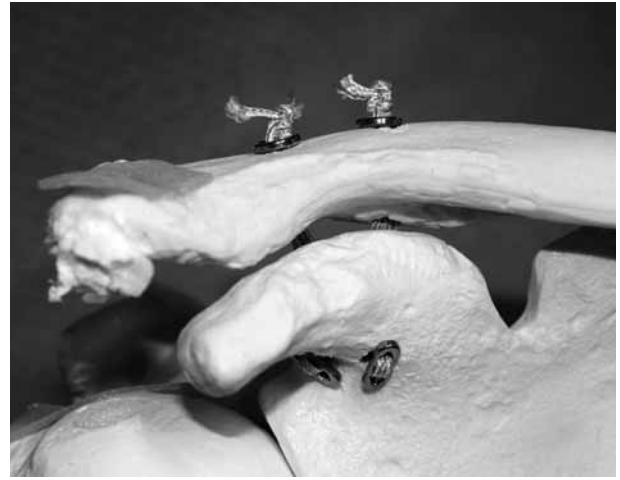
Fig. 4. — Principle of TightRope™ AC-joint repair. Two devices span the space between the coracoid and the clavicle in an anatomic two tunnel manner. The buttons are flipped and the device is tightened.

of motion, not before week 7 post-operatively. Return to contact sports activities is allowed 6 months after the procedure.