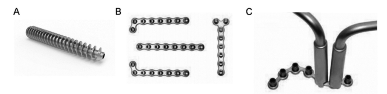
Fig. 1. – 3.5 mm Acutrak headless screws (A) and F3<sup>®</sup> Fragment Plating System (Zimmer Biomet) (B). This kind of mini-plate with easy-moulding property (C) offers strong fixation and minimum tissue irritation

Lateral approach was applied in most cases while posterior approach through olecranon osteotomy was applied when posterior trochlea and median part of trochlea were involved. A lateral skin incision was located at 5cm proximal to the elbow extending towards the radial head. The incision can be extended toward the proximal end of the humerus by splitting the origin of the radial wrist extensors. Pronating the forearm to move the radial nerve away from the operative region. Distal humerus articular was exposed through Kocher interval and fragments were temporarily fixated using K-wires. After checking fracture reduction using C-arm fluoroscopy, 3.5 mm standard headless compression screws (Acutrak)were used to stabilize the fracture, the screws were inserted in an anterior to posterior direction through at least 2 different angles. For plate group, additional F3® Fragment Plating System (Zimmer Biomet) were applied to provide posterior support and lateral stability (Fig 1). Concomitant injuries were fixated simultaneously.