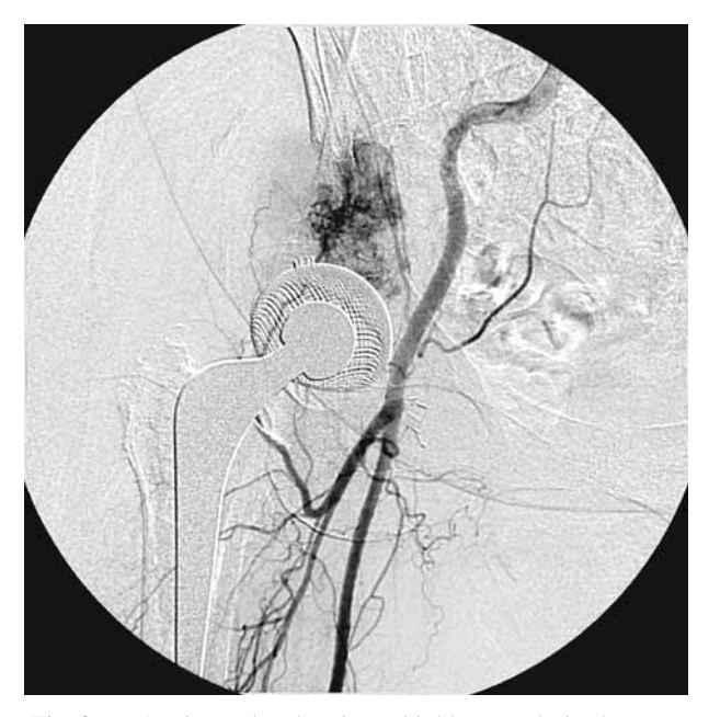
Fig. 2. — Angiography showing a highly vascularised metastasis proximal to the cementless cup.

arteries interrupted the blood flow to the lesion. Following embolisation, curettage of the tumoral tissue was done through an anterior iliac incision. The apical part of the cup was exposed. There was