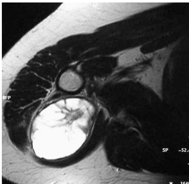
Fig. 2. — Magnetic resonance imaging (MRI) on axial view of the shoulder showing a 4 cm × 6 cm mass with high signal intensity on T2-weighted sequence.

Magnetic resonance imaging of the shoulder revealed a septated mass limited anteriorly by the infraspinatus, triceps and teres minor, and posteriorly by the deltoid muscle ; the mass demonstrated