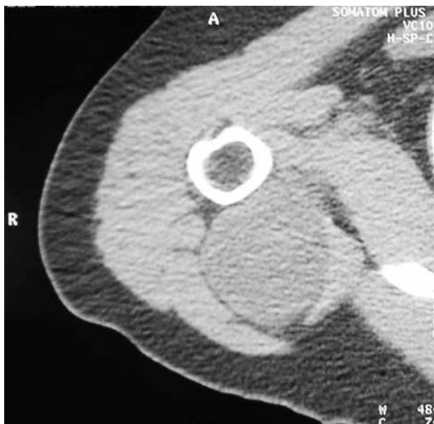
Fig. 1. — CT examination of the shoulder revealing a 6 × 4 × 6 cm mass containing both solid and cystic components, with the solid components showing heterogeneous enhancement.