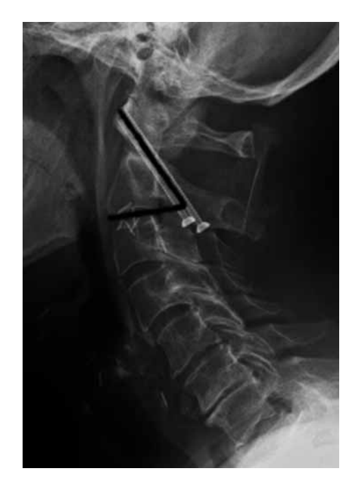
Fig. 1. — Plain radiograph, lateral view : Determination of the angle between the inferior end plate of C2 and the inserted screws.

The atlantoaxial instability was determined radiographically using the criteria defined by Apuzzo et al (3) and Hadley et al (14): more than 2 mm motion on flexion/extension views and/or more than 5 mm displacement or more than 11° angulation of the odontoid. Each patient had conventional radiographs of the cervical spine in two planes, pre- and postoperatively and during follow-up. The angle between the inferior end plate of C2 and the screws was determined postoperatively and at follow-up, according to Blauth et al (4) (fig 1). The closer the angle was to 90°, the steeper the orientation of the screws and the more central their position in the pedicle. Computed tomography of the cervical spine was performed pre- and postoperatively; coronal and sagittal reconstructions, focused on the foramina, were used to plan the screw trajectory and to measure the pedicle size. According to Madawi et al (18), the screw