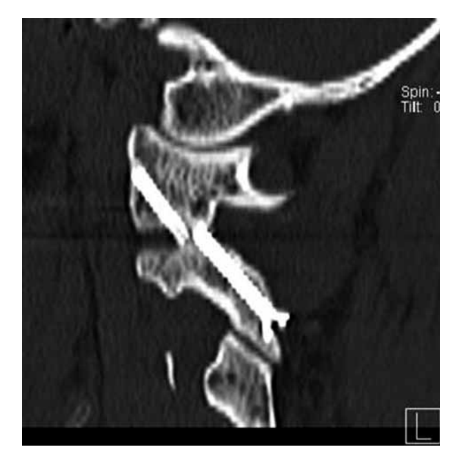
Fig. 4. — Reformatted CT-scan, lateral view. Screw breakage at the typical location.