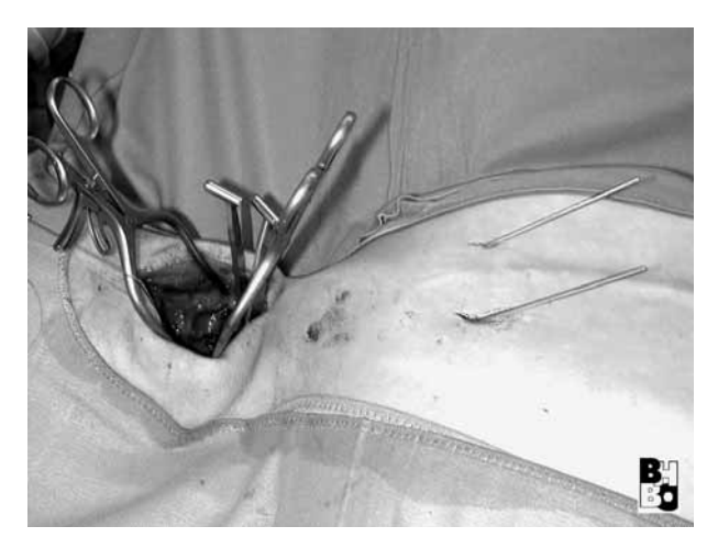
Fig. 3. — The operative field after insertion of the K-wires. Soft tissue dissection is minimised by percutaneous placement of the 2-mm K-wires.