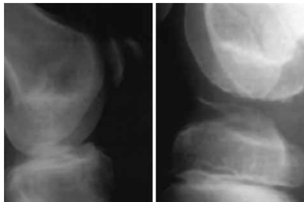
Fig. 1. — Meyers-McKeever Classification Type I & II Fractures.

Fourteen children and 11 adults were reviewed. The average age of children at the time of injury was 13 years (range 8-16 years) and the average age of adults was 28 years (range, 18-49 years).