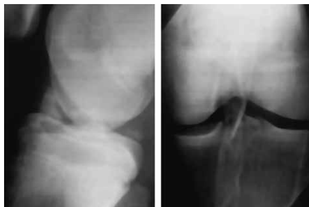
Fig. 2. — Meyers-McKeever Classification Type III & IV Fractures.

Among children, 10 were boys and 4 were girls and in adults, four were men and seven were women. All patients attended the emergency department on the day of injury, except one who attended 4 days after injury. Nineteen cases were Type III and six were Type IV following Meyers and McKeever's classification (8) (fig 1 & 2).