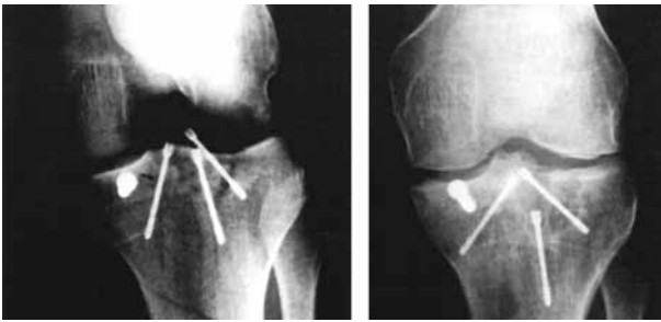
Fig. 5. — Migration of Herbert Screw

One patient developed superficial skin infection which subsided with a course of antibiotics. Ten patients (40%) felt numbness around the operative scar and 2 patients (8%) had a hypersensitive scar causing discomfort on kneeling. Two adults had migration of a Herbert screw, which was fortunately into the substance of tibia and did not affect union or displacement of the fracture (fig 5). One child developed non-union (fig 6) which required re-fixing with an absorbable stitch.