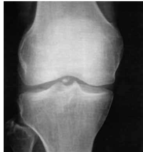
Fig. 6. — Non-union

Fracture of the anterior tibial spine is an uncommon injury. Skak et al reported an incidence of 3/100,000 children per year (13). The avulsion fracture of the tibial attachment of the ACL is also commonly known as fracture of the anterior tibial spine of the intercondylar eminence. Both these