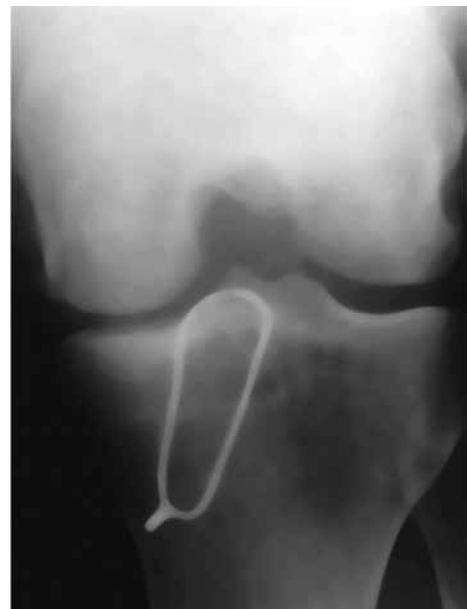
Fig. 4. — Stainless steel wire loop

the two groups in children was not significant (Mann Whitney U test p = 0.21 ; Fischer exact test p = 0.30 ). In adults, patients fixed with absorbable material achieved a median Lysholm knee score of 80 (range 22-81) while patients fixed with non-absorbable materials achieved a median Lysholm score of 94.5 (range 49-95). The difference between the two groups in adults was also not significant (Mann Whitney U test p = 0.21 ; Fischer exact test p = 0.18 )