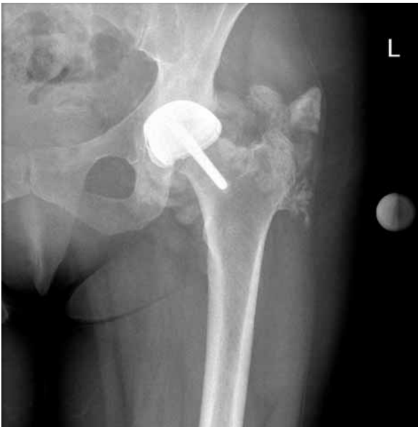
Fig. 1. — Radiograph at presentation suggesting heterotopic bone formation with concern about a neoplastic process.

ossification and calcification were noted on radiographs. This was investigated further by MRI scan which revealed a well-defined large soft tissue mass around the lateral and posterior aspects of the femoral neck. A biopsy of the mass was undertaken to exclude a neoplastic lesion. This revealed the presence of wear debris and excluded an infective or neoplastic process. Further radiographs showed a collapse and obvious wear of the prosthesis with further progression of radiological appearance of presumed heterotopic ossification (fig 1). A decision was made to revise the left hip to a total hip replacement.