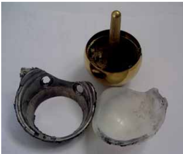
Fig. 2. — The explanted prosthesis showing the worn metal backing with the polyethylene liner and the titanium nitride coated femoral component.