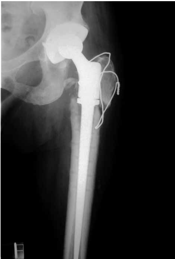
Fig. 3. — Revision with total hip arthroplasty

tion hardware was removed. Multiple tissue specimens were taken for bacteriological testing. The trochanteric fracture line was opened, a digastric osteomuscular flap was created, preserving the continuity between the abductor muscle (gluteus medius and minimus) and the vastus lateralis. The short external rotator muscles were divided, the digastric flap was retracted anteriorly, and the femoral head was removed after posterior capsulotomy. A horizontal saw cut was made above or below the lesser trochanter, depending on the location of the fracture line and comminution, so as to find a solid bearing zone in the posterior medial cortex. The femoral shaft was prepared using quadrangular rasps. The collar of the final femoral stem was made to rest against the horizontal cut line (fig 3). The long stem enabled the screw holes to be bridged after implant removal (fig 3). Full circumferential support is not necessary because the stability of the stem is primarily ensured by the metaphyseal-diaphyseal press-fit of the quadrangular stem. In