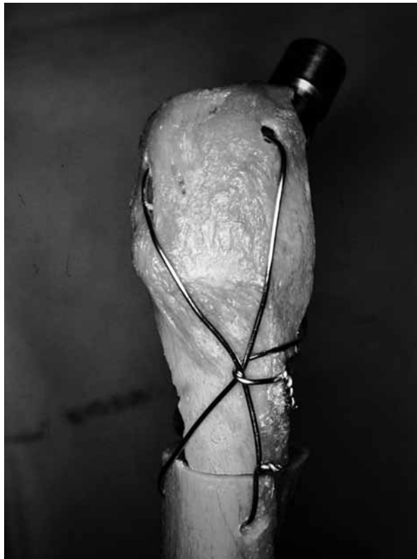
Fig. 4. — A tension band-wire with one or two cerclage wires reconstructs the greater trochanter and fixes the digastric flap between gluteus medius and vastus lateralis to prevent its anterior displacement.

tion hardware was removed. Multiple tissue specimens were taken for bacteriological testing. The trochanteric fracture line was opened, a digastric osteomuscular flap was created, preserving the continuity between the abductor muscle (gluteus medius and minimus) and the vastus lateralis. The short external rotator muscles were divided, the digastric flap was retracted anteriorly, and the femoral head was removed after posterior capsulotomy. A horizontal saw cut was made above or below the lesser trochanter, depending on the location of the fracture line and comminution, so as to find a solid bearing zone in the posterior medial cortex. The femoral shaft was prepared using quadrangular rasps. The collar of the final femoral stem was made to rest against the horizontal cut line (fig 3). The long stem enabled the screw holes to be bridged after implant removal (fig 3). Full circumferential support is not necessary because the stability of the stem is primarily ensured by the metaphyseal-diaphyseal press-fit of the quadrangular stem. In