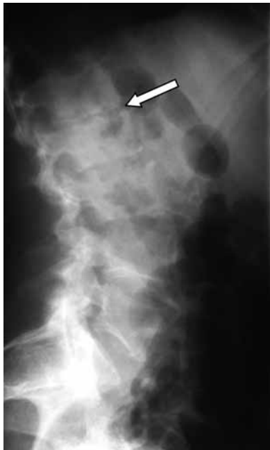
Fig. 1. — Plain lateral radiograph of the lumbosacral spine at initial presentation, arrowhead showing reduced L1/2 disc space.