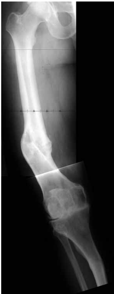
Fig. 1. — Right knee, preoperative AP radiograph.

The operation was performed with the Johnson & Johnson DePuy navigation system, which involves an implant-specific, passive marker technology-based, CT-free device. A PFC Sigma