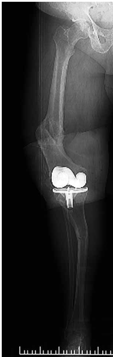
Fig. 5. — Right lower limb, postoperative AP radiograph.

One year postoperatively, the knee score was 89 and the functional score was 90, with a 0-90° knee flexion. The patient now walks without any walking aid, has resumed heavy physical work and is overall free of complaints.