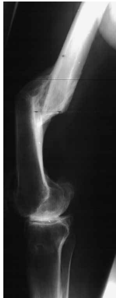
Fig. 2. — Right knee, preoperative lateral radiograph.