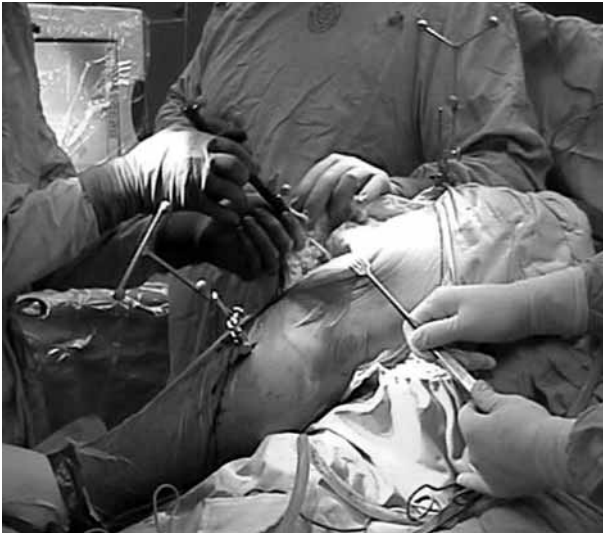
Fig. 3. — Application of reference guides.

posterior cruciate retaining modular total knee prosthesis was implanted.