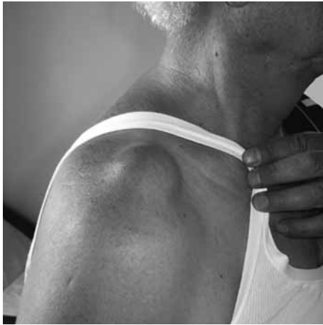
Fig. 1. — Supero-lateral aspect of the patient's right shoulder, as seen on his admission to hospital. A visible lump over the AC joint is apparent.

the right shoulder, which was first noticed 25 days previously (fig 1). He did not recall previous shoulder trauma and he experienced only mild symptoms at both shoulders especially after vigorous overhead activities (mild pain at rest or during forward elevation after strenuous manual work). The mass was symmetric with regular borders, no color