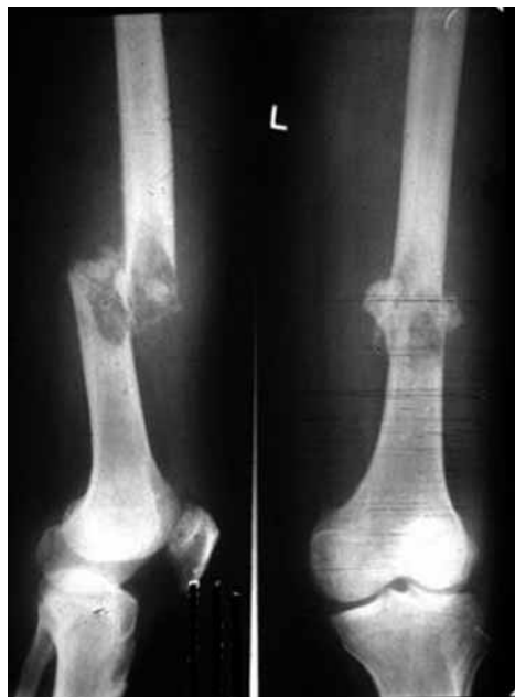
Fig. 1. — Pre-operative anteroposterior and lateral radiographs of a patient with multiple myeloma showing pathological fracture of the distal femur.

patients with multiple myeloma who underwent limb salvage and custom megaprosthesis replacement for pathological fractures.