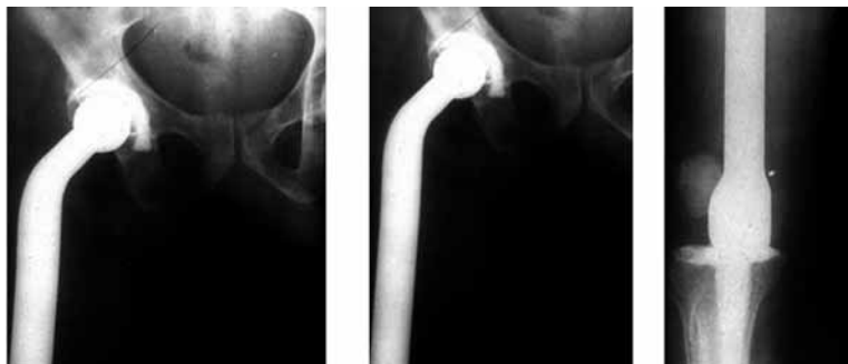
Fig. 4. — Post-operative radiographs of the femur of the patient after resection and reconstruction with total femoral prosthesis