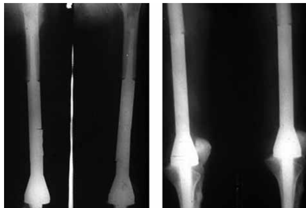
Fig. 2. — Post-operative radiographs of the femur of the same patient after resection and reconstruction with a total knee prosthesis.

All patients had a skeletal survey to detect multifocal involvement. Four patients each had Computed Tomography and Magnetic Resonance Imaging to assess the extent of involvement. The diagnosis was confirmed by open biopsy in four and closed biopsy in