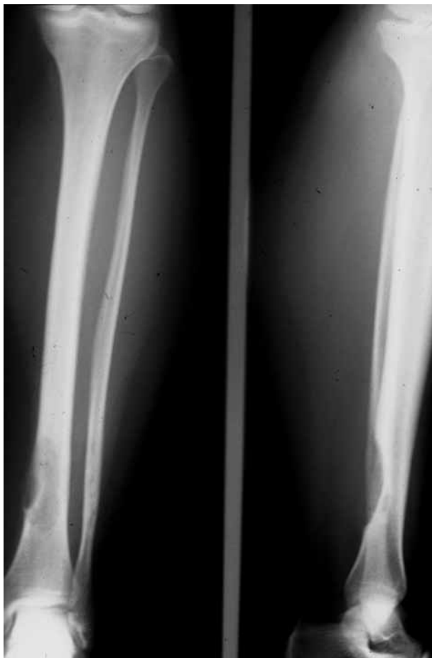
Fig. 1. — Radiologic features of adamantinoma

MRI may also reveal the exact location and volume of the tumour and clarify whether or not it has affected the surrounding soft tissues (53, 58).