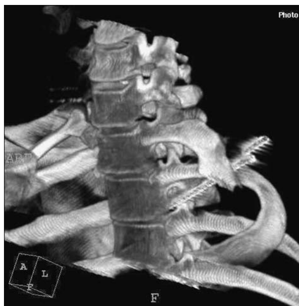
Fig. 3. — 3-D reconstruction showing the Kirschner wire trajectory and its entry point in the spinal canal (left scapula and part of the left first rib have been digitally removed).

which was immediately sealed with fibrin glue. The electric pain disappeared immediately after surgery and immediate physiotherapy was initiated. Six weeks after the operation, the patient had