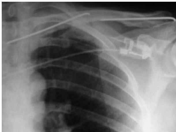
Fig. 1. — Chest radiograph, AP view. Note the migrated K-wire projecting in front of the spine, and its initial location with another K-wire still in place.

interpreted as drug withdrawal signs. Upon admission, his gait was limited to a few steps and was impossible without crutches.