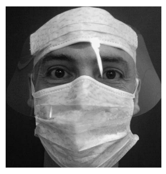
Fig. 1. — Frontal view of the splash screen after application

Because the nose is covered by a separate mask and the application with this modality allows ventilation from the side of the visor the problem of condensation is reduced.