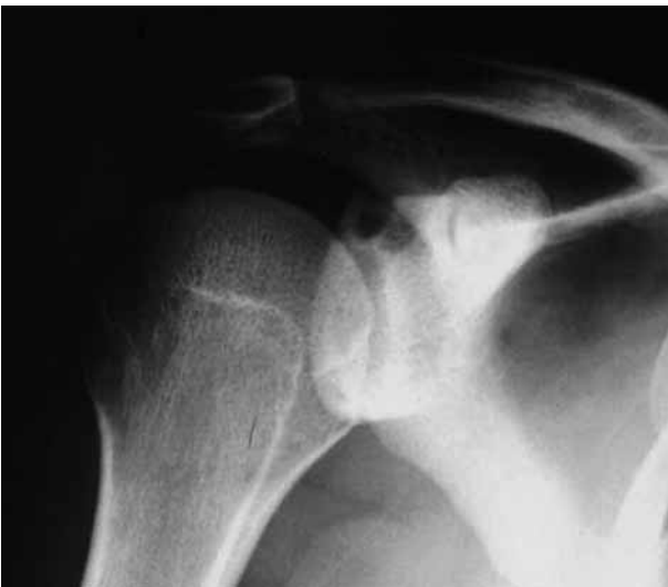
Fig. 1. — Antero-posterior radiograph with externally rotated arm showing osteolysis around the absorbable anchor positioned in the superior pole of the glenoid.

Appropriate conservative therapy, including non-steroidal anti-inflammatory drugs, physiotherapy and rest, was started without result. Subsequently, the patient underwent an arthroscopy, which revealed a type II SLAP lesion. Arthroscopic repair was performed with a PLLA double loaded bioabsorbable suture anchor. The postoperative course was uneventful and the patient restarted playing volley 4 months after surgery. Eight months after the operation the shoulder pain recurred at sporting. The O'Brien test was again positive. Medication and physical therapy did not bring relief. Ten months after surgery radiographs and CT-scans showed a large lytic lesion in the superior pole of the glenoid in the area of the suture anchor (fig 1, 2). A second arthroscopy was then performed, 12 months after the first one. Partial failure of the repair was noted. The labrum and the sutures were debrided; a cavity was now seen in the superior pole of the glenoid in the area of the initial suture anchor (fig 3). This time a non-absorbable suture anchor was used for repair. Histologic examination of the tissue harvested