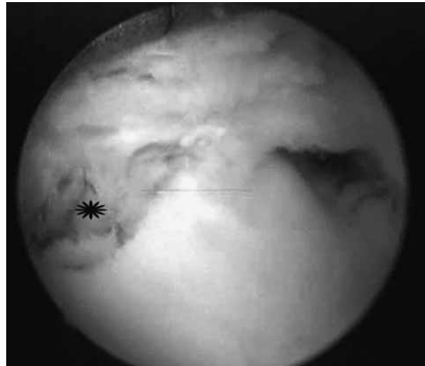
Fig. 3. — Arthroscopic view of the superior pole of the glenoid, from a posterior portal, showing a bony hole (star).

from the bony defect in the superior pole of the glenoid showed a foreign body granuloma.