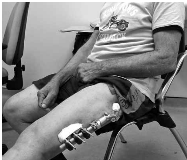
Fig. 2. — Sitting in a chair is possible with the Citieffe/Ch-N

Exclusion criteria were: a previous hip fracture, a fracture secondary to a malignant tumour, multiple fractures, chemotherapy and a body weight above 80 kg.